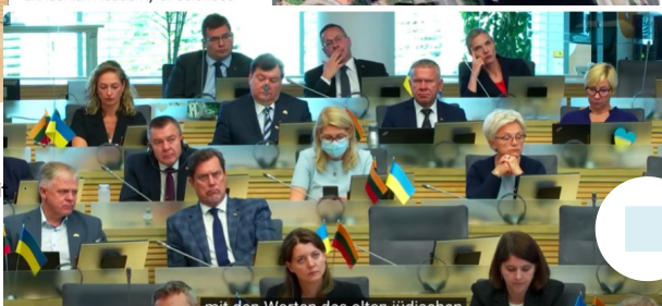
mit den Worten des alten jüdischen