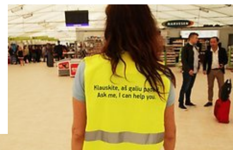
Kaunas Airport copes with increased traffic after Vilnius Airport shuts for upgrades