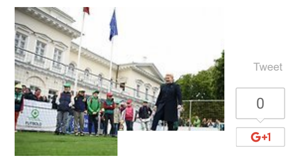
Ending Seimas session – ł