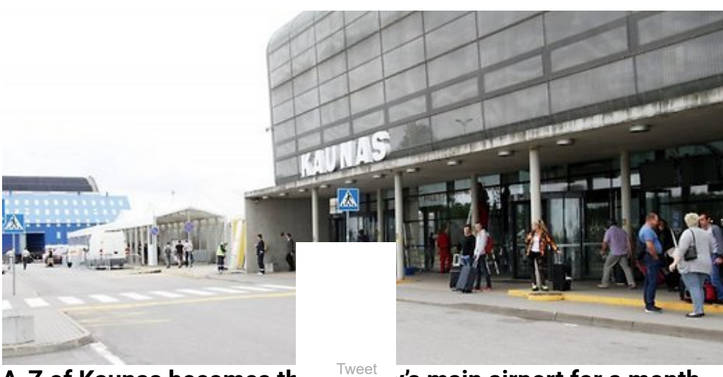
A-Z of Kaunas becomes th