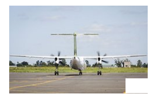
Scenario that will repeat in