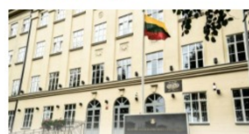
Vilniaus Šolomo Aleichemo ORT gimnazija