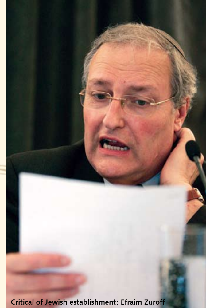
Critical of Jewish establishment: Efraim Zuroff