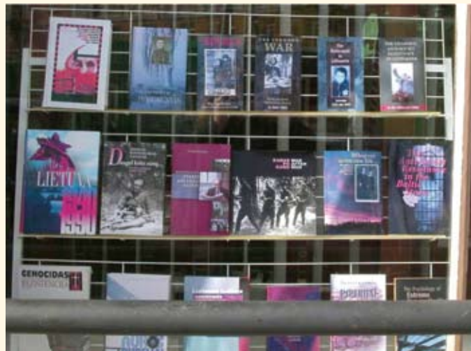
Now being prosecuted: Soviet Partisans, c.1941

groups [qualifying as victims of] the crime of genocide — they are national, ethnic, racial, and religious groups. However, the definition of the very term genocide by its author, Raphael Lemkin, also involved attacks against political and social groups... It was only at the last moment that with efforts of the Soviet Union and its satellites — other puppet communist regimes — no place was left in the final text of the convention for repression against political groups.”