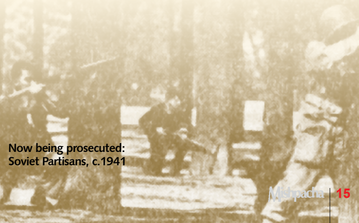
Now being prosecuted: Soviet Partisans, c.1941

Prosecuting Heroes Another manifestation of the Baltic attempt to rewrite history in recent years has been a wave of accusations and investigations against Jewish heroes who escaped death by fighting alongside Soviet partisans against the Nazis. Particularly in Lithuania, prosecutors are combing the memoirs of several elderly Jews for evidence that they murdered Lithuanian citizens.