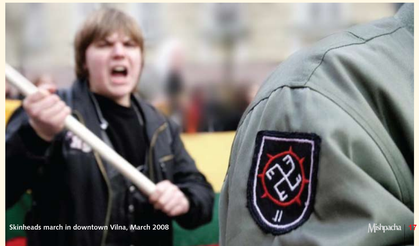
Skinheads march in downtown Vilna, March 2008

"The latest campaign to prosecute Soviet anti-Nazi Jewish partisans is merely another link in this chain of historical duplicity and distortion. The truth about the Shoah must finally be told in