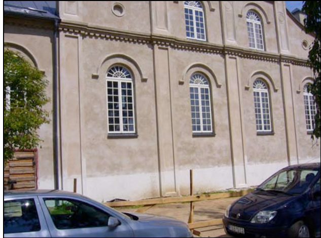
The red shul of Jonishkis