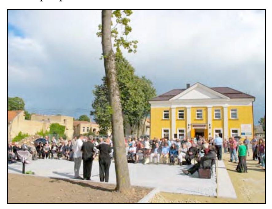
The Culture house in Zagare

The weather is unpredictable: midsummer showers alternate with shafts of sunlight breaking through threatening clouds. Will heavy rain will hold off until the plaque has been unveiled?