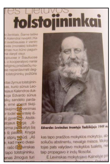
At the Levinskas house