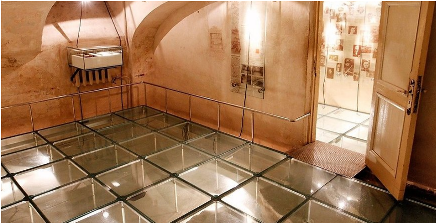
Genocide Victims Museum