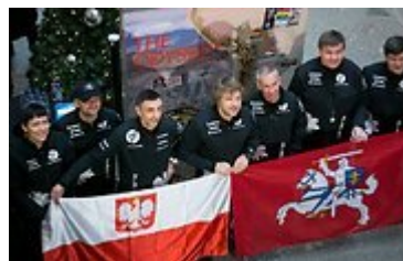
Życzenia Świąteczne, Biały Orzeł i Czarny Jastrząb na Dakarze (21)