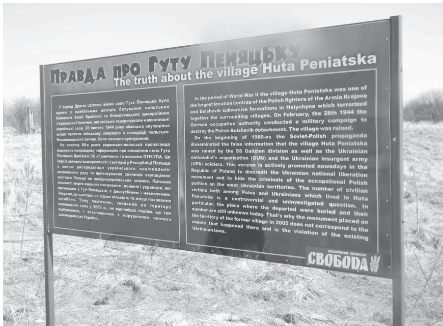
Figure 12.5 Denial of war crimes: Bi-lingual Svoboda billboard on the site of the Polish village Huta Pieniacka, burnt along with more than 700 of its residents by the Fourth Police Regiment of the Waffen-SS Galizien and a detachment of the Ukrainian Insurgent Army on February 29, 1944. Svoboda categorically denies the conclusions of the Polish and Ukrainian historical commissions.

Focusing on divisive and sensitive issues, Svoboda provocatively denies any involvement of the Waffen-SS Galizien in atrocities against the Polish