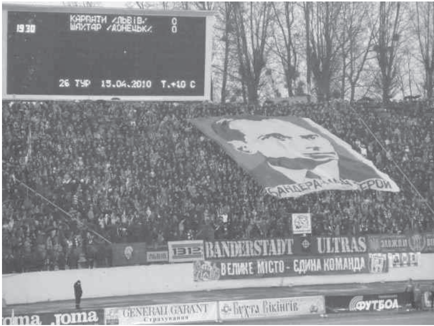
Figure 12.1 “Bandera—Our Hero,” giant portrait of the OUN(b) leader displayed by far-right football fans, the “Banderstadt ultras,” during a game between Karpaty Lviv and Shakhtar Donetsk. Spring 2010.

Ukrainian statehood” was re-enacted in Lviv as a popular festival, where parents with small children waved flags to re-enactors in SS uniforms (“U Lvovi vidtvoryly podii 1941-ho roku,” 2011). Extremist football supporters, so-called ultras , promote Lviv as Banderstadt at football games and other events.