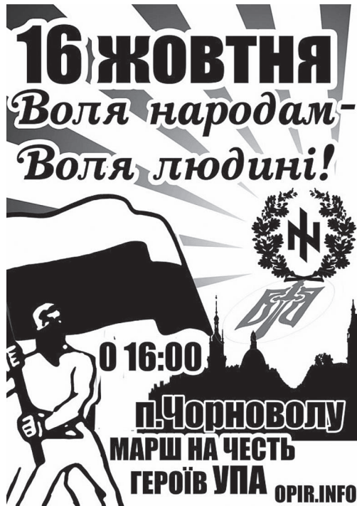
Figure 12.9 “March in honor of the Heroes of UPA,” Lviv, October 16, 2011, leaflet by the Autonomous Nationalists, featuring the OUN and UPA slogan Volia narodam, volia liudyny! (Freedom to nations! Freedom for man!), featuring the Wolfsangel , in a radiant wreath of oak leaves, the OUN symbol, a trident with a sword (from 1940 the symbol of OUN(m)), and the red and black OUN(b) and UPA banner, symbolizing Blut und Boden .