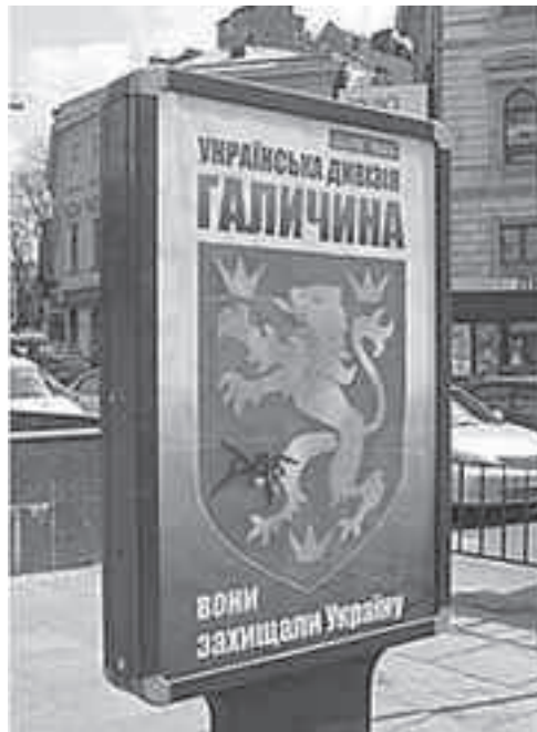
Figure 12.7 Lviv, April 2009. Svoboda poster: "The pride of the nation: The Ukrainian Division "Galicia." They defended Ukraine."

Yushchenko went down for a disastrous defeat in 2010, receiving 5.5 per cent of the popular vote, a historical record for an incumbent president (Kompanets, 2010). While he is no longer a serious political player, Yushchenko left behind a legacy of myths which helped legitimized Svoboda's ideology. Svoboda's appropriation of many rituals in honour of "national heroes" from more moderate nationalists is but one expression of its increased political strength in post-Yushchenko Western Ukraine. Svoboda has long been well represented at the annual commemoration of the birthday of Stepan Bandera, complete with torchlight parades. On January 29, 2011,